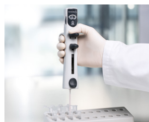
Dispensing small volumes