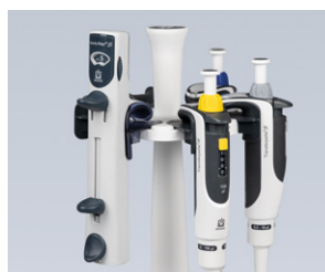
The rack mount also fits the Transferpette® S bench-top rack.