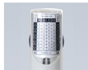
Fast volume selection with the volume table on the back side