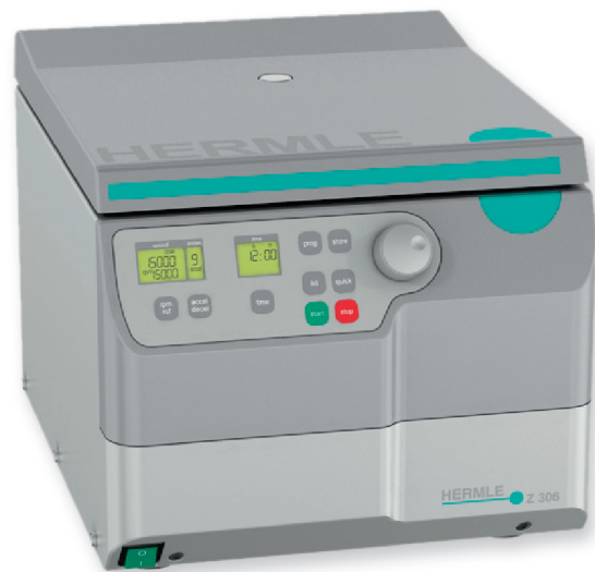
Universal Centrifuge Z 306

Max. Speed: 13,000 rpm Max. Volume: 24 x capillaries