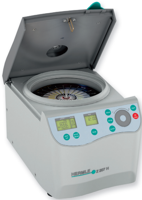
Hematocrit Centrifuge Z 207 H

Max. Speed: 13,000 rpm Max. Volume: 24 x capillaries