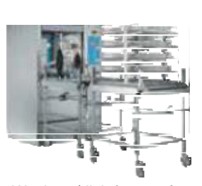
Washers/disinfectors for hospitals and laboratories