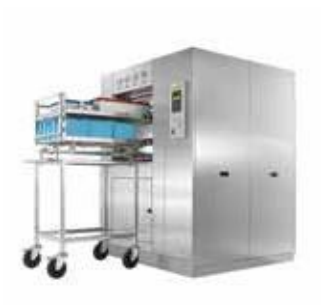
Large sterilizers for various industries and market needs

Featuring Tuttnauer's range of cleaning, disinfection and sterilization solutions